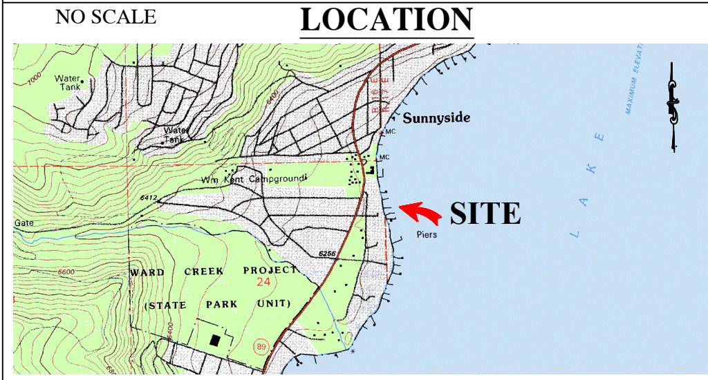
Exhibit A PRC 4854.1 HEWLETT FAMILY TRUST APN 084-154-007, 008 & 009 GENERAL LEASE - RECREATIONAL USE PLACER COUNTY