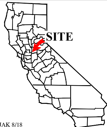
Exhibit B PRC 8041.9 BLM APN 148-0010-061, 063, 146-0120-021 GENERAL LEASE- PUBLIC AGENCY USE SACRAMENTO COUNTY

This Exhibit is solely for purposes of generally defining the lease premises, is based on unverified information provided by the Lessee or other parties and is not intended to be, nor shall it be construed as, a waiver or limitation of any State interest in the subject or any other property.