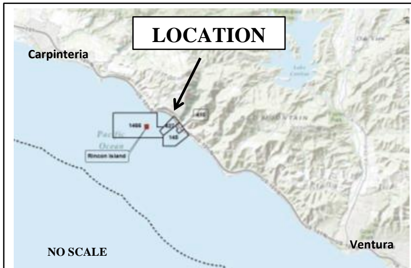
EXHIBIT A PRCs 145.1, 410.1, 1466.1 Rincon Island Limited Partnership Termination of Oil and Gas Leases VENTURA COUNTY