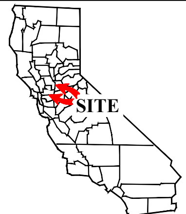
Exhibit A PRC 5107.1 CPN PIPELINE COMPANY GENERAL LEASE - RIGHT-OF-WAY USE YOLO, SACRAMENTO, SOLANO & CONTRA COSTA COUNTIES

This Exhibit is solely for purposes of generally defining the lease premises, is based on unverified information provided by the Lessee or other parties and is not intended to be, nor shall it be construed as, a waiver or limitation of any State interest in the subject or any other property.