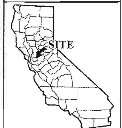
Exhibit A PRC 7859.1 PHILLIPS 66 COMPANY GENERAL LEASE - RIGHT-OF-WAY USE CONTRA COSTA COUNTY

This Exhibit is solely for purposes of generally defining the lease premises, is based on unverified information provided by the Lessee or other parties and is not intended to be, nor shall it be construed as, a waiver or limitation of any State interest in the subject or any other property.