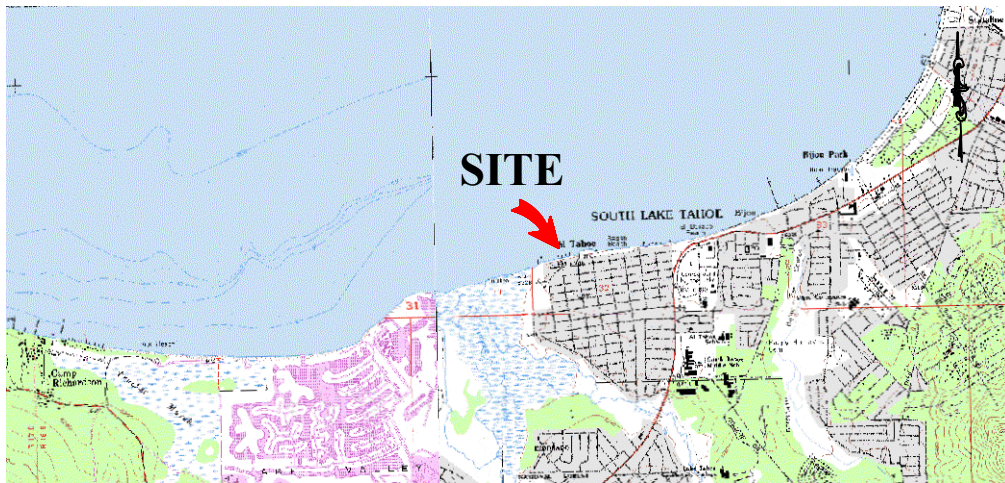
MAP SOURCE: USGS QUAD