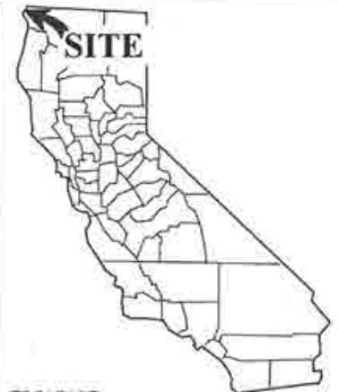
Exhibit B W 27085 TOLOWA DEE-NI' NATION APN 102-010-12 GENERAL LEASE - OTHER DEL NORTE COUNTY

This Exhibit is solely for purposes of generally defining the lease premises, is based on unverified information provided by the Lessee or other parties and is not intended to be, nor shall it be construed as, a waiver or limitation of any State interest in the subject or any other property.