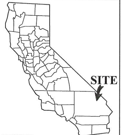
Exhibit B W 23751 FORT IRWIN U.S. ARMY CESSION OF CONCURRENT CRIMINAL JURISDICTION SAN BERNARDINO COUNTY

This Exhibit is solely for purposes of generally defining the premises, is based on unverified information provided by the U.S. Army and is not intended to be, nor shall it be construed as, a waiver or limitation of any State interest in the subject or any other property.