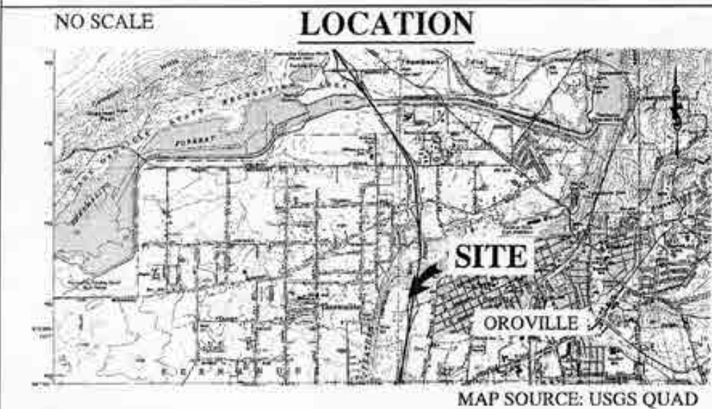
Exhibit B PRC 6751.1 FEATHER RIVER RECREATIONAL & PARK DISTRICT GENERAL LEASE - PUBLIC AGENCY USE BUTTE COUNTY