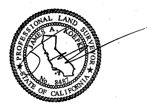
Page 1 of 2

Prepared November 3, 2015 by the California State Lands Commission Boundary Unit.