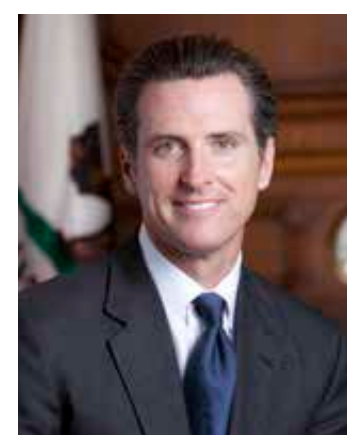
GAVIN NEWSOM Lieutenant Governor