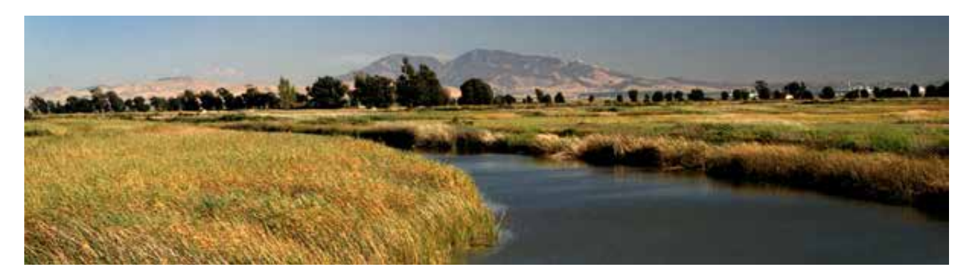
MESSAGE FROM THE CHAIRPERSON