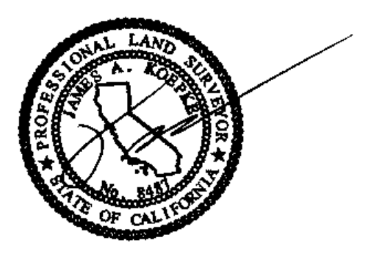
Page 2 of 2

Prepared 07/08/15 by the California State Lands Commission Boundary Unit