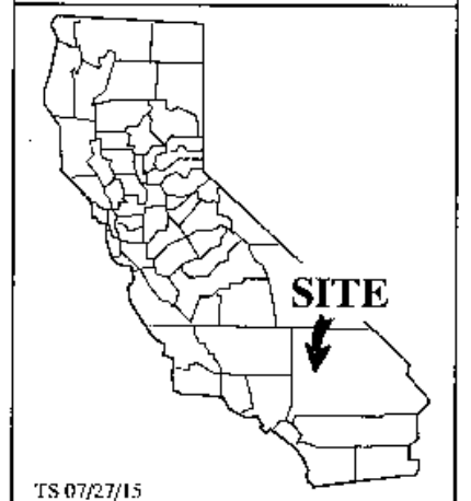
Exhibit B W 26860 ACCEPTANCE OF CLEAR LIST & CONSENT TO RECORDING SAN BERNARDINO COUNTY