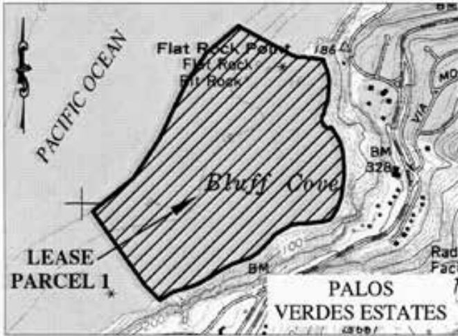
PACIFIC OCEAN AT BLUFF COVE