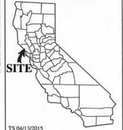
Exhibit B PRC 3348.9 COUNTY OF SONOMA APNs 097-130-015, 021; 096-170-007; 096-140-021 GENERAL LEASE - PUBLIC AGENCY USE SONOMA COUNTY

This Exhibit is solely for purposes of generally defining the lease premises, is based on unverified information provided by the Lessee or other parties and is not intended to be, nor shall it be construed as, a waiver or limitation of any State interest in the subject or any other property.