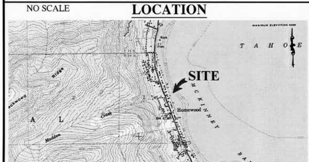
Exhibit B PRC 4140.1 BREUNER APN 097-100-020 GENERAL LEASE - RECREATIONAL USE PLACER COUNTY