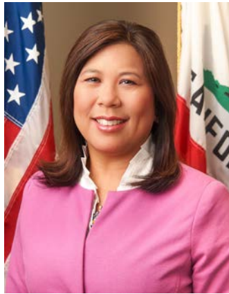
BETTY T. YEE State Controller