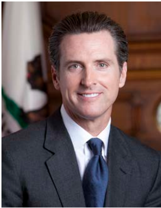
GAVIN NEWSOM Lieutenant Governor