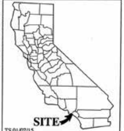
Exhibit B W 26791 COUNTY OF ORANGE APNs MULTIPLE GENERAL LEASE - DREDGING ORANGE COUNTY