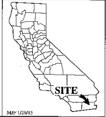
Exhibit B PRC 9116.0 IMPERIAL WELLS POWER LLC QUITCLAIM IMPERIAL COUNTY

This Exhibit is solely for purposes of generally defining the lease premises, is based on unverified information provided by the Lessee or other parties and is not intended to be, nor shall it be construed as, a waiver or limitation of any State interest in the subject or any other property.