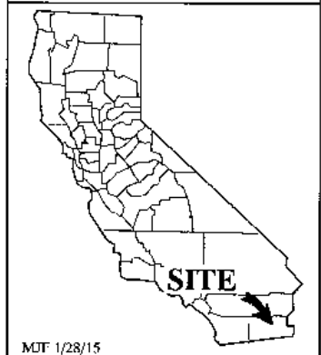
Exhibit B PRC 9115.2 IMPERIAL WELLS POWER LLC QUITCLAIM IMPERIAL COUNTY

This Exhibit is solely for purposes of generally defining the lease premises, is based on unverified information provided by the Lessee or other parties and is not intended to be, nor shall it be construed as, a waiver or limitation of any State interest in the subject or any other property.