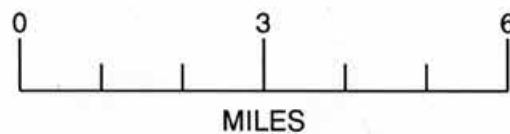
Exhibit B W 26764 LADWP OWENS LAKE HYDROLOGIC MONITORING STRUCTURES INYO COUNTY