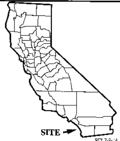
Exhibit A PRC 8834.1 SURFSONG OA APN 298-520-01 GENERAL LEASE- PROTECTIVE STRUCTURE SAN DIEGO COUNTY

This Exhibit is solely for purposes of generally defining the lease premises, is based on unverified information provided by the Lessee or other parties and is not intended to be, nor shall it be construed as, a waiver or limitation of any State interest in the subject or any other property.