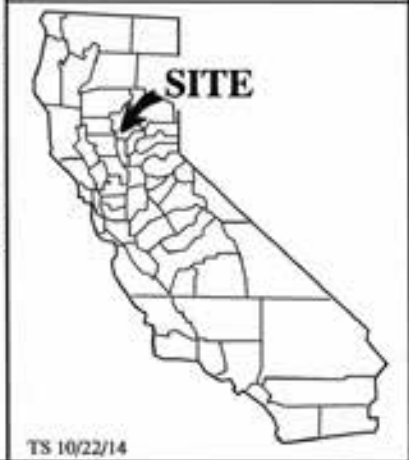
Exhibit A PRC 5852.1 CA WATER SERVICE CO. GENERAL LEASE - RIGHT-OF-WAY USE BUTTE COUNTY

This Exhibit is solely for purposes of generally defining the lease premises, is based on unverified information provided by the Lessee or other parties and is not intended to be, nor shall it be construed as, a waiver or limitation of any State interest in the subject or any other property.