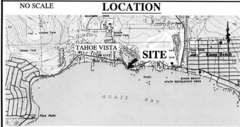
Exhibit B2 PRC 5739.1 BIG WATER VIEW, LLC APN 117-110-069 & 117-110-070 GENERAL LEASE - COMMERCIAL USE PLACER COUNTY