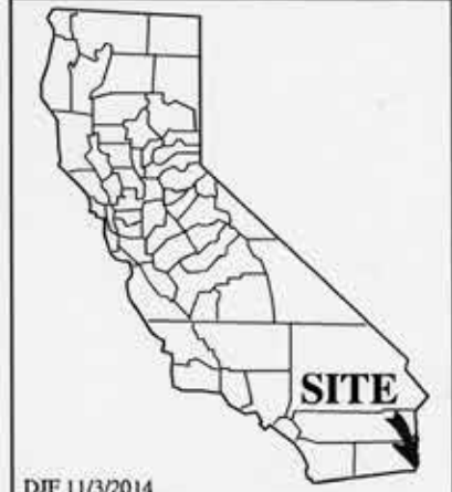
Exhibit A PRC 2344.1 IMPERIAL IRRIGATION DISTRICT GENERAL LEASE - RIGHT-OF-WAY USE IMPERIAL COUNTY

This Exhibit is solely for purposes of generally defining the lease premises, is based on unverified information provided by the Lessee or other parties and is not intended to be, nor shall it be construed as, a waiver or limitation of any State interest in the subject or any other property.