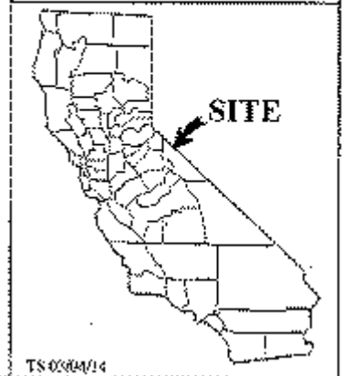
Exhibit B W 40949 ENIGMA RESOURCES LLC APN 009-140-002 MINERAL PROSPECTING PERMIT APPLICATION MONO COUNTY

This Exhibit is solely for purposes of generally defining the lease premises, is based on unverified information provided by the Lessee or other parties and is not intended to be, nor shall it be construed as, a waiver or limitation of any State interest in the subject or any other property.