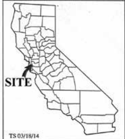
Exhibit B PRC 2380.9 ALAMEDA COUNTY FLOOD CONTROL AND WATER CONSERVATION DISTRICT APNs 482-0095-003, 482-0090-003 & 482-0080-003 GENERAL LEASE - PUBLIC AGENCY USE ALAMEDA COUNTY