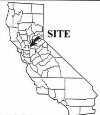
Exhibit B PRC 7796.1 PACIFIC FRUIT FARMS APN 142-0040-033 GENERAL LEASE - RECREATIONAL USE SACRAMENTO COUNTY