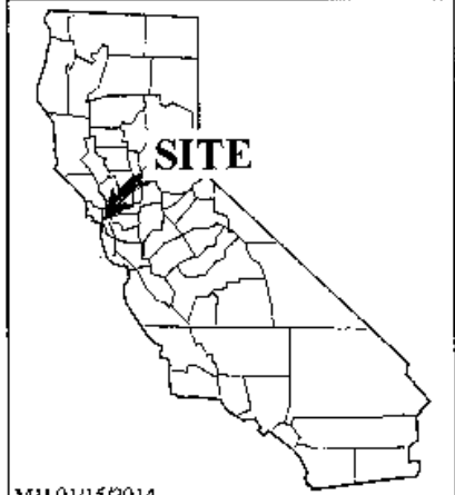
Exhibit B PRC 5921.9 CALIFORNIA DEPARTMENT OF PARKS AND RECREATION GENERAL LEASE - PUBLIC AGENCY USE SAN FRANCISCO COUNTY

This Exhibit is solely for purposes of generally defining the lease premises, is based on unverified information provided by the Lessee or other parties and is not intended to be, nor shall it be construed as, a waiver or limitation of any State interest in the subject or any other property.