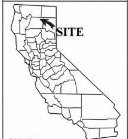
Exhibit B PRC 7701.9 SHASTA COUNTY APNs 016-320-56, 67 & 016-340-06 GENERAL LEASE - PUBLIC AGENCY USE SHASTA COUNTY