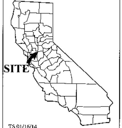
Exhibit B PRC 8625.1 BEAVER TRUSTEES APN 142-0110-011 GENERAL LEASE - RECREATIONAL USE SACRAMENTO COUNTY

This Exhibit is solely for purposes of generally defining the lease premises, is based on unverified information provided by the Lessee or other parties and is not intended to be, nor shall it be construed as, a waiver or limitation of any State interest in the subject or any other property.