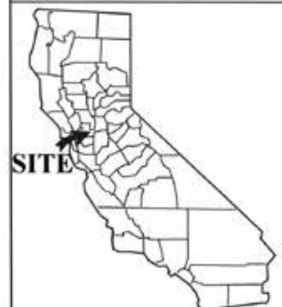
Exhibit A PRC 3277.1 CHEVRON GENERAL LEASE- RIGHT-OF-WAY USE CONTRA COSTA, SOLANO, SACRAMENTO & YOLO COUNTIES