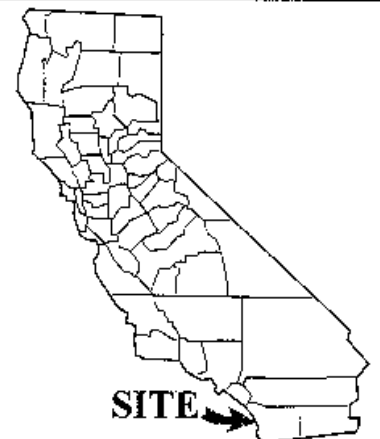
Exhibit B PRC 7233.9 CITY OF DEL MAR GENERAL LEASE - PUBLIC AGENCY USE SAN DIEGO COUNTY