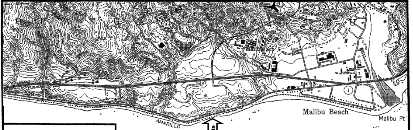
Exhibit A W24665 25160 Malibu Road