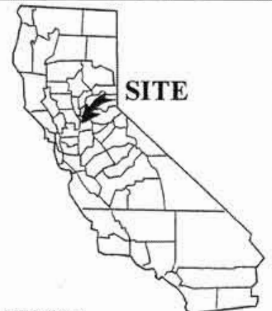
Exhibit B PRC 4616.1 YOKOI TRUST APN 016-0201-004 GENERAL LEASE - RECREATIONAL USE SACRAMENTO COUNTY