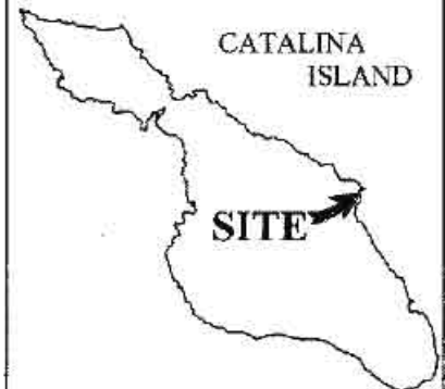
Exhibit B PRC 6440.1 GUIDED DISCOVERIES APN 7480-041-004 GENERAL LEASE - RECREATIONAL USE LOS ANGELES COUNTY