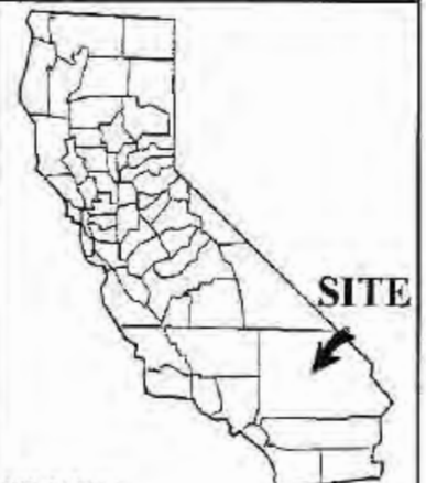
Exhibit B PRC 6375.2 MOLYCORP MINERALS, LLC GENERAL LEASE - RIGHT-OF-WAY USE SAN BERNARDINO COUNTY

This Exhibit is solely for purposes of generally defining the lease premises, is based on unverified information provided by the Lessee or other parties and is not intended to be, nor shall it be construed as, a waiver or limitation of any State interest in the subject or any other property.