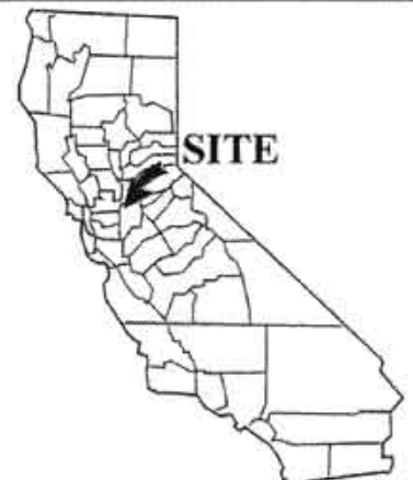
Exhibit B W 26525 PORT OF STOCKTON APN 145-020-09 & 162-030-01 GENERAL LEASE - PUBLIC AGENCY USE SAN JOAQUIN COUNTY

This Exhibit is solely for purposes of generally defining the lease premises, is based on unverified information provided by the Lessee or other parties and is not intended to be, nor shall it be construed as, a waiver or limitation of any State interest in the subject or any other property.