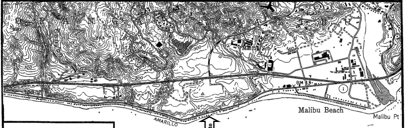
Exhibit A W24665 24230 Malibu Road