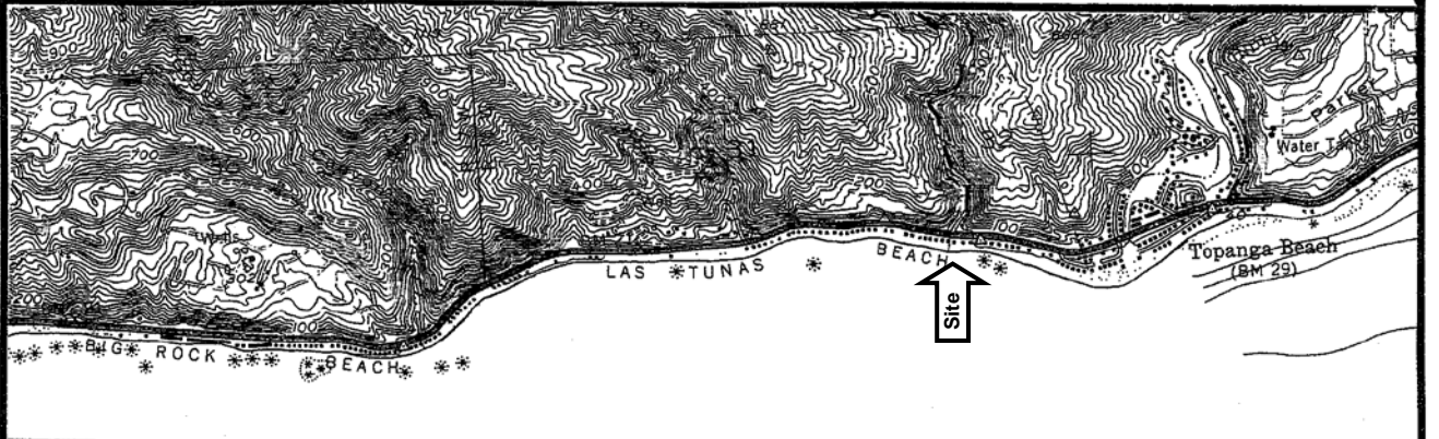
Exhibit A W24665 19034 Pacific Coast Highway