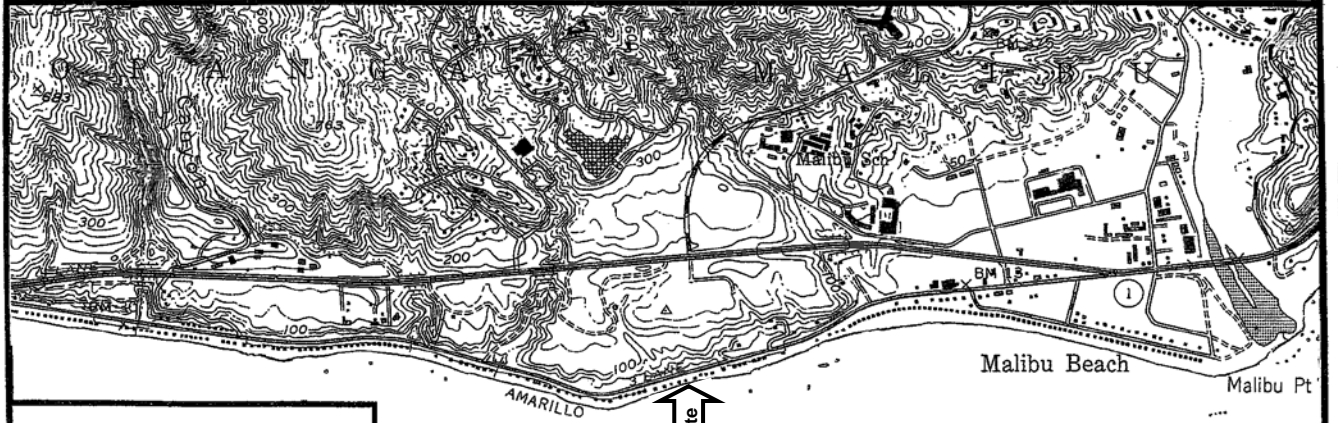
Exhibit A W24665 23812 Malibu Road