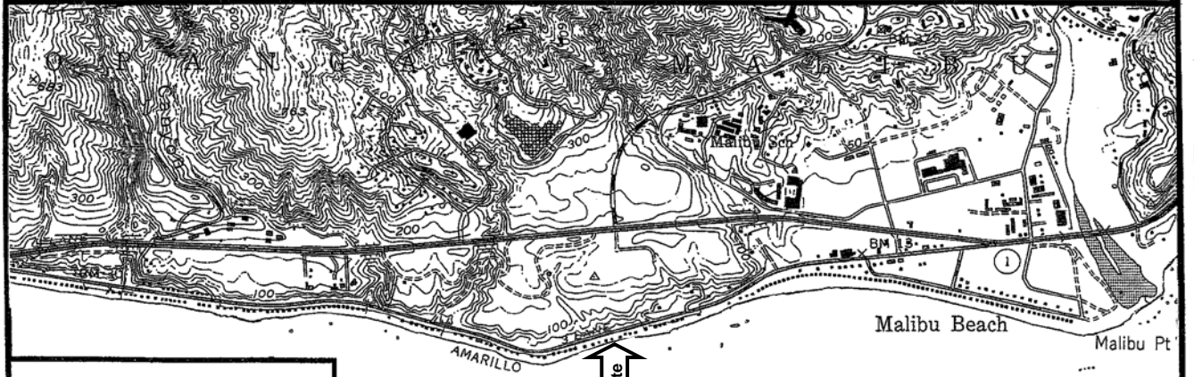
Exhibit A W24665 24844 Malibu Road