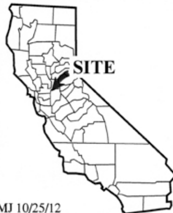
Exhibit A STEAMBOAT RESORT CLUB PRC 3885.1 APN 142-0030-029 GENERAL LEASE - COMMERCIAL USE GRAND ISLAND SACRAMENTO COUNTY

This Exhibit is solely for purposes of generally defining the lease premises, is based on unverified information provided by the Lessee or other parties and is not intended to be, nor shall it be construed as, a waiver or limitation of any State interest in the subject or any other property