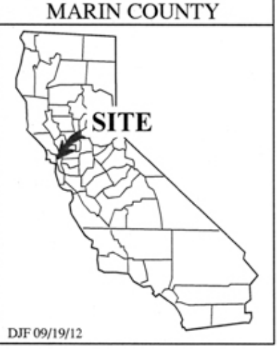
Exhibit B W 26576 ROYAL COURT HOMEOWNERS GENERAL LEASE DREDGING

This Exhibit is solely for purposes of generally defining the lease premises, is based on unverified information provided by the Lessee or other parties and is not intended to be, nor shall it be construed as, a waiver or limitation of any State interest in the subject or any other property.