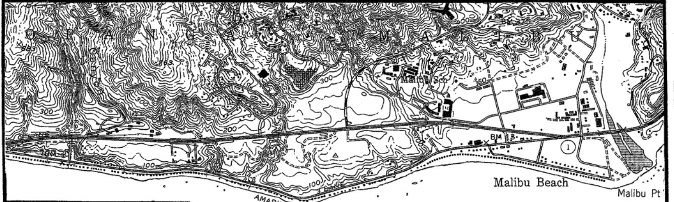
Exhibit A W24665 24460 Malibu Road