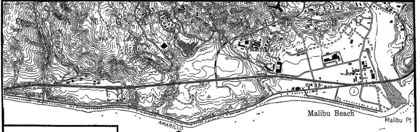
Exhibit A W24665 24456 Malibu Road