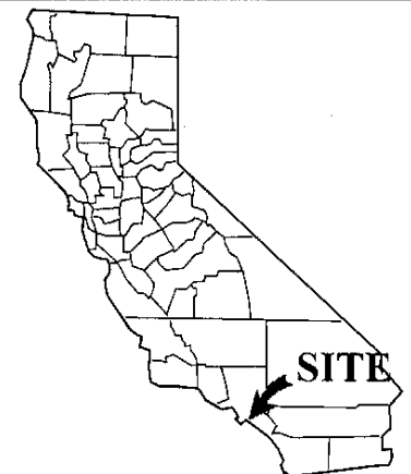
Exhibit B W 26482 LOS CERRITOS WETLANDS AUTHORITY APN 043-160-36, 45, 47, 53 PUBLIC AGENCY LEASE ORANGE COUNTY

This Exhibit is solely for purposes of generally defining the lease premises, is based on unverified information provided by the Lessee or other parties and is not intended to be, nor shall it be construed as, a waiver or limitation of any State interest in the subject or any other property.