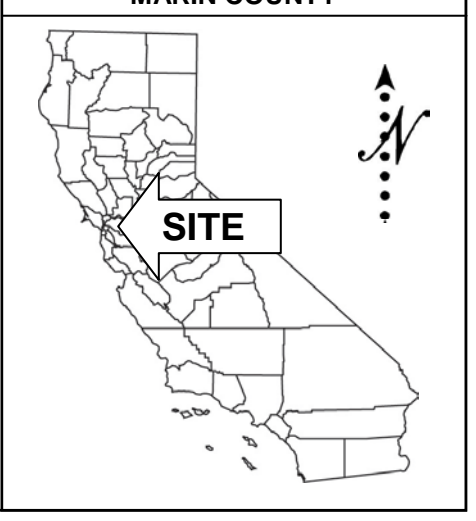
Exhibit A SLL 111 FORMER HAMILTON ARMY AIRFIELD MARIN COUNTY

This exhibit is solely for purposes of generally defining the lease premises, is based on unverified information provided by the Lessee or other parties, and is not intended to be, nor shall it be construed as a waiver or limitation of any State interest in the subject or any other property.