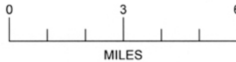
Exhibit A PRC 8957.9 LADWP OWENS LAKE GENERAL LEASE - PUBLIC AGENCY USE INYO COUNTY