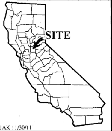
Exhibit B PRC 6002.9 CITY OF WEST SACRAMENTO GENERAL LEASE - PUBLIC AGENCY USE YOLO COUNTY